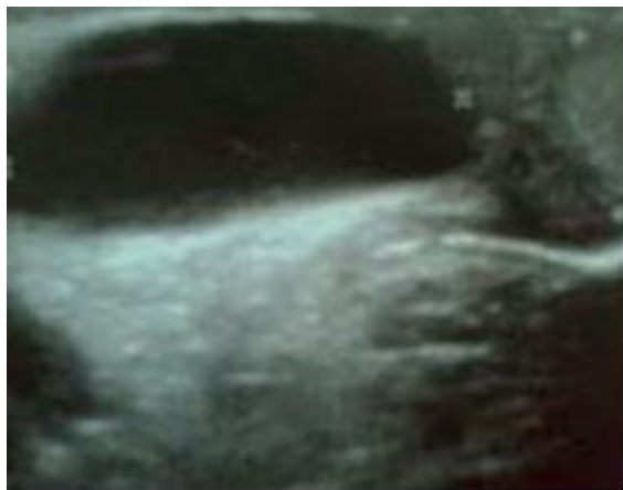
Fig. 2. Ultrasound imaging of the 2 cm diameter intraparenchymal epididymal cyst (3rd case).

This was followed by an ultrasound examination a) of the scrotum which revealed a single-compartment thin-walled cyst without humps, within the parenchyma of the head of the epididymis, with diameter of 1.5–4 cm respectively and b) an ultrasound of the kidneys-ureters-bladder, with normal findings (Table 1, Fig. 2).