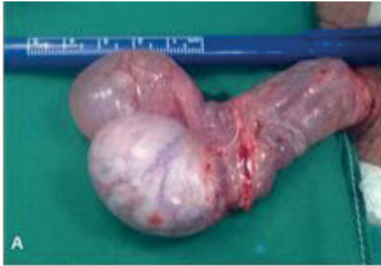
Fig. 3. IEC with diameter of 3.8 cm in the 4th case (testis and epididymis after their externalization from the hemiscrotum). Notice that the IEC occupies the head of the epididymis.

Surgical treatment followed on an elective basis with general endotracheal anesthesia. The approach was standard with a transverse incision in the middle of the hemiscrotum, opening of the dart, the external spermatic, the cremaster and the internal spermatic fascia, the tunica vaginalis and albuginea and then exteriorization of the testis and epididymis. The intraparenchymal cyst in the head of the epididymis was identified in all cases and enucleated and removed without rupture (Fig. 3, 4).